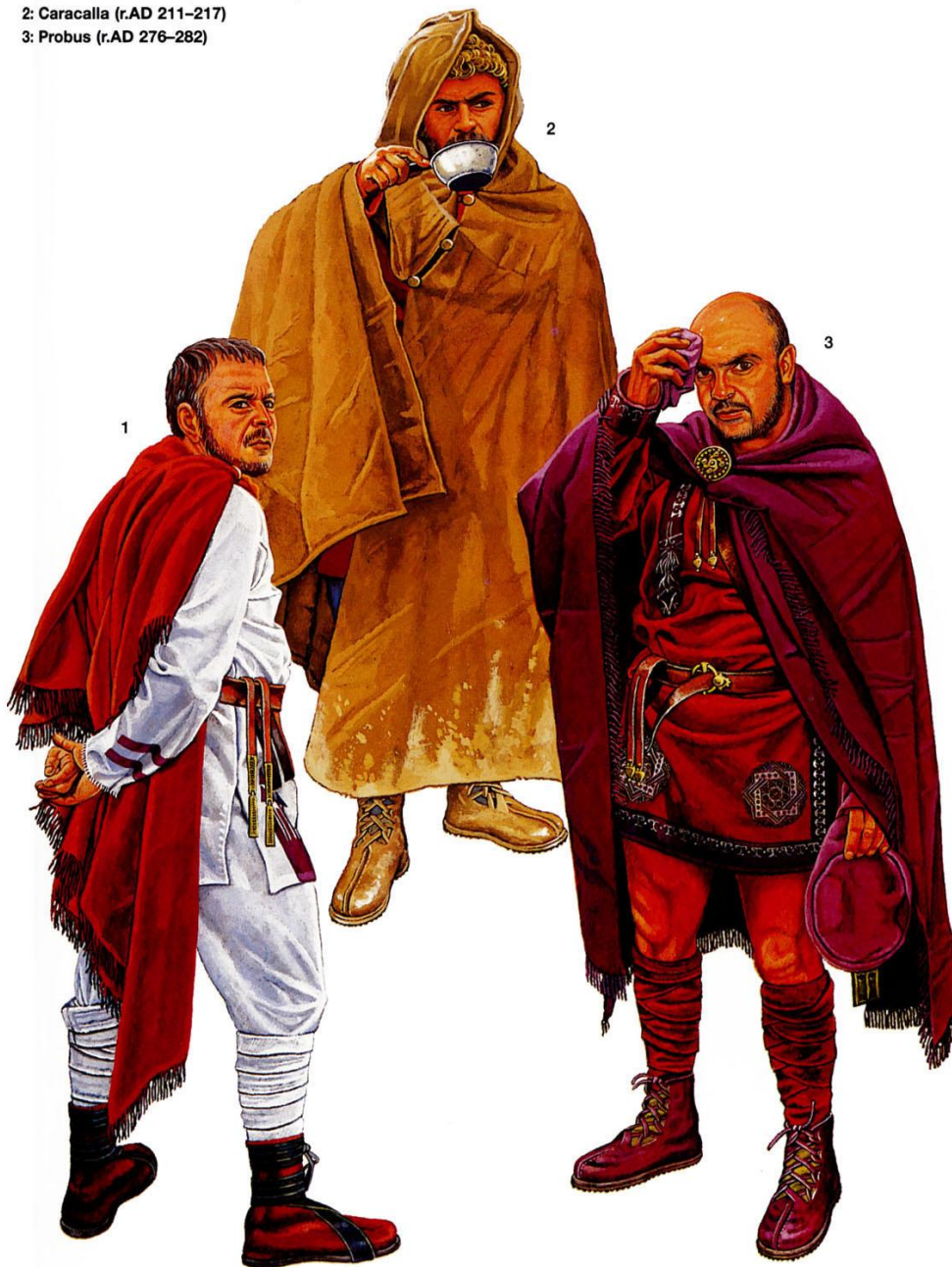
EMPERORS IN THE FIELD 1: Severus Alexander (r.AD 222–235) 2: Caracalla (r.AD 211–217) 3: Probus (r.AD 276–282)