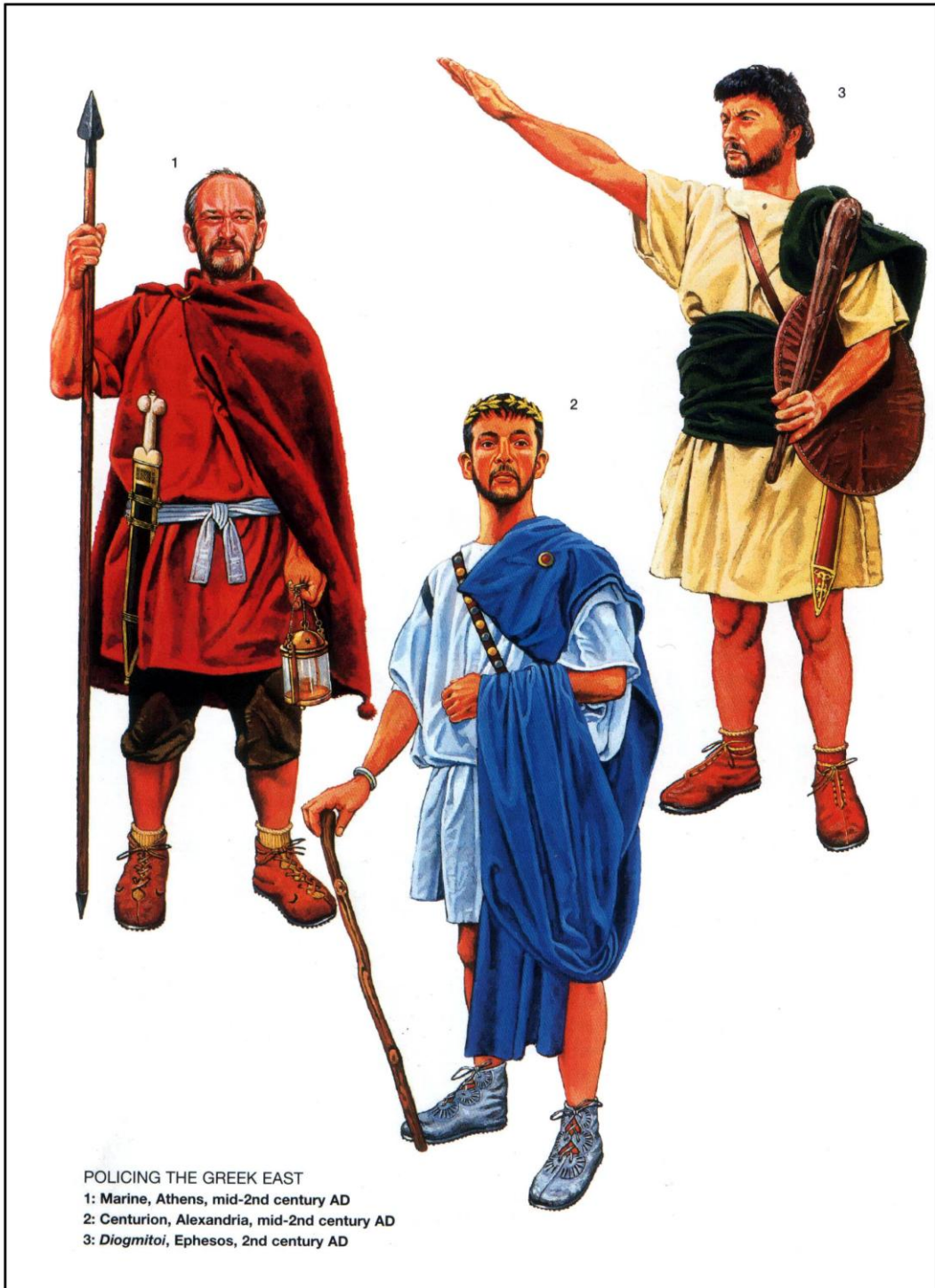
POLICING THE GREEK EAST 1: Marine, Athens, mid-2nd century AD 2: Centurion, Alexandria, mid-2nd century AD 3: Diogmitoi , Ephesos, 2nd century AD